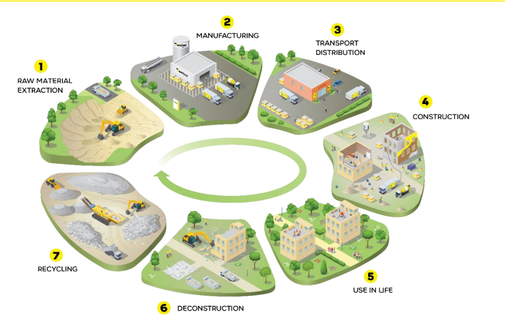
Figure 1: Life Cycle illustration of a product for construction